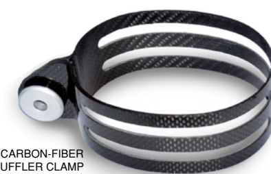
CARBON-FIBER MUFFLER CLAMP