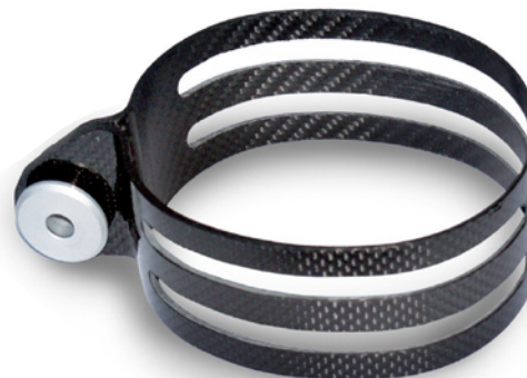
CARBON-FIBER MUFFLER CLAMP