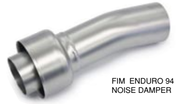
FIM ENDURO 94 dB NOISE DAMPER