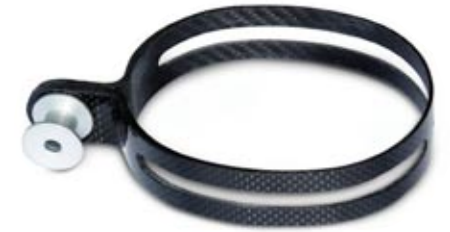
CARBON-FIBER MUFFLER CLAMPS