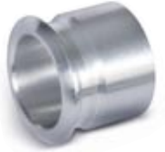
FIM MX 98 dB NOISE DAMPER