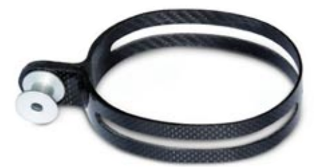
CARBON-FIBER MUFFLER CLAMPS