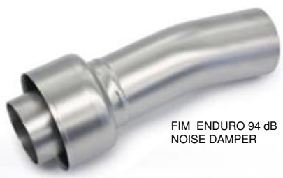
FIM ENDURO 94 dB NOISE DAMPER