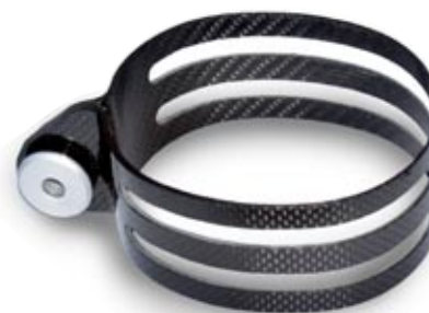
CARBON-FIBER MUFFLER CLAMPS