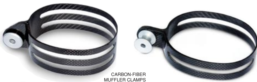
CARBON-FIBER MUFFLER CLAMPS